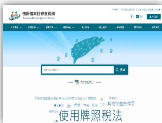
Navigating Electronic Agencies' Records (NEAR) website

As of 2022, a total of over 462,867,529 government agency records catalogs were published on NAA's NEAR website ( https://near.archives.gov.tw ).