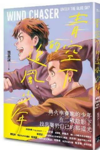
The comic book “Wind Chaser under the Blue Sky”

NAA collaborated with BOCH, Ministry of Culture on the “2021-2022 Research and Publication Project of Taiwan Railway Archives (Significant Antiquities)”. Cartoonist Jia-Cheng Jian was commissioned to draw the comic book "The Wind Chaser under the Blue Sky", authorized by NAA based on archival records selected as significant antiquities by the Ministry of Culture. NAA granted Gaea Books the rights to publish and promote the comic book, which is available on channels like Books.com.tw, Eslite Online, Kingstone Bookstore, etc.