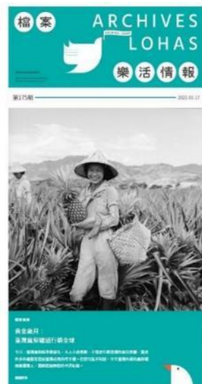
Homepage updating of "Archives LOHAS"

To promote the information and use of archives, NAA published the first issue of monthly archives news "Archives LOHAS" on July 16, 2007. It provides information about policies, services, access to archives, and latest events of NAA, as well as new knowledge concerning archives. Subscribers include applicants for access to archives, teachers at related departments in universities and colleges, scholars, specialists, and organizations conducting historical research, records managers from government agencies, and so on. In 2022, 12 issues of "Archives LOHAS" covering No. 175 to No. 186 were published, and the number of subscribers reached over 18,311.