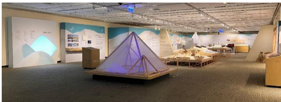
Photos from "Think Big Exhibition" (top left), "Eat More, Eat Better: An Archival Exhibition on the Dietary Culture of Taiwan" (top right) and "Crystal Memories of Salt: An Archival Exhibition on Taiwan's Salt Industry" (bottom)