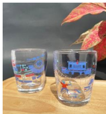
New archives-related cultural goods were launched in 2022