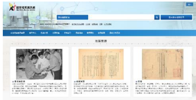
Archives Access Service website