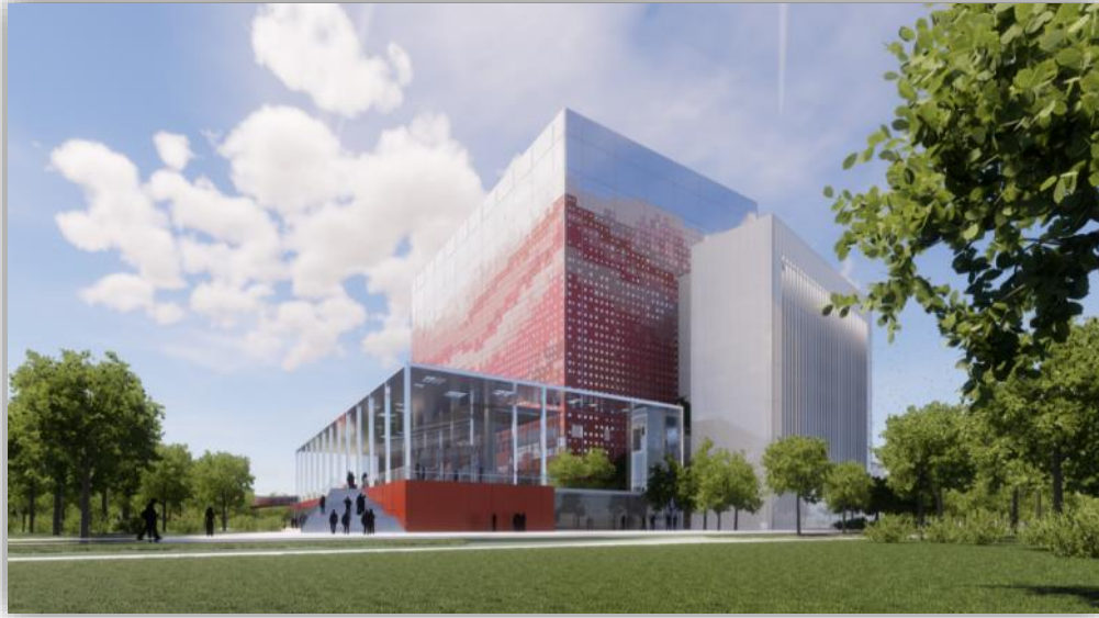
National Archives building facade simulation