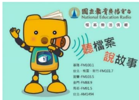
The radio program "Listening to Archives, Telling Stories" of the NER

To promote archives services, NAA has worked with the National Education Radio (NER) Taipei to produce a program called "Listening to Archives, Telling Stories" since the first broadcast on January 20, 2017. People can listen to the program every fourth Friday morning of the month. In 2022, 12 programs were broadcast in 2022.