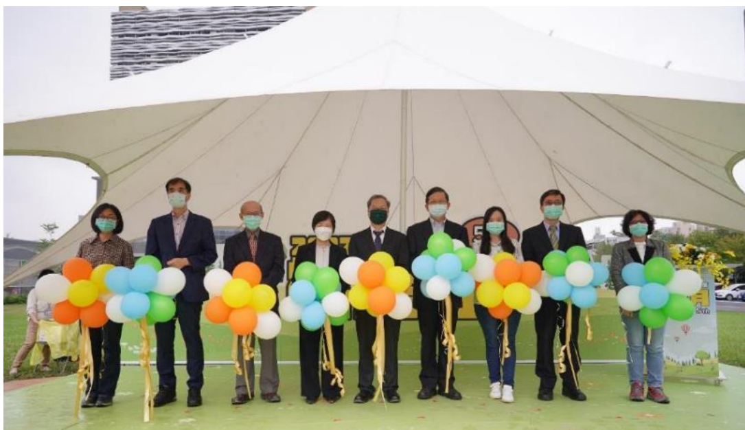
The grand opening for the 2022 Archives Month was held at the lawn outside National Taiwan University Archives.

NAA held 14 live activities, attracting over 5,000 participants.