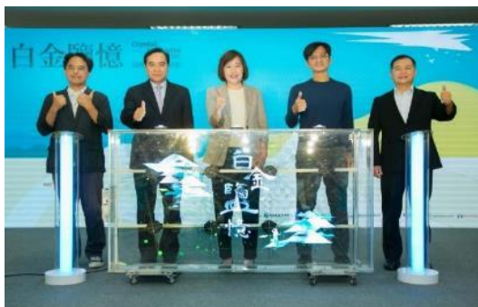
The grand opening for "Crystal Memories of Salt: An Archival Exhibition on Taiwan's Salt Industry" was held at the Green Gallery in Xinzhuang Joint Office Tower, Executive Yuan, on October 19, 2022.