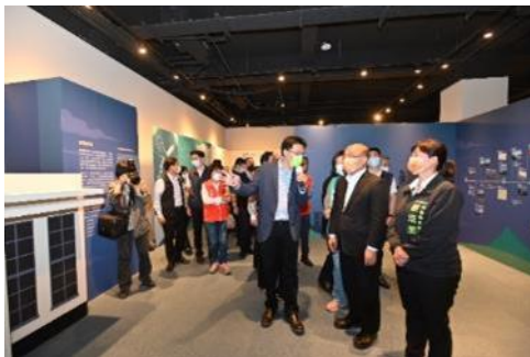
Memories of Harbors: An Archival Exhibition on the South and North Ports of Taiwan.

The Taiwan Provincial Administration Information Hall is one of the high-quality exhibition halls in central Taiwan with social, educational and cultural functions. The hall not only has permanent exhibitions, but also holds special exhibitions and activities. These exhibitions combined archives and art to make visitors realize the importance of archives preservation and to accelerate the use of archives. In 2022, The Taiwan Provincial Administration Information Hall held 1 archive exhibition, 6 art exhibitions, and several volunteer guide training programs.