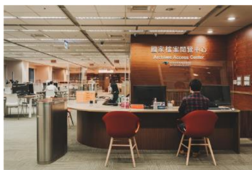
Archives Access Center provides archival access to the public

The main services of the Archives Access Center include accepting applications for access to archives, facilitating archives catalog queries, providing professional publications on archives management, and introducing archival holdings. In 2022, a total of 1,178 people were served and 1,228 items from the archives were provided. According to the "Purpose of Visit" questionnaires (multiple choices were allowed), 970 people applied for access to archives, 54 people applied for information inquiries, 27 people applied for access to publications, and 177 people applied for other purposes.