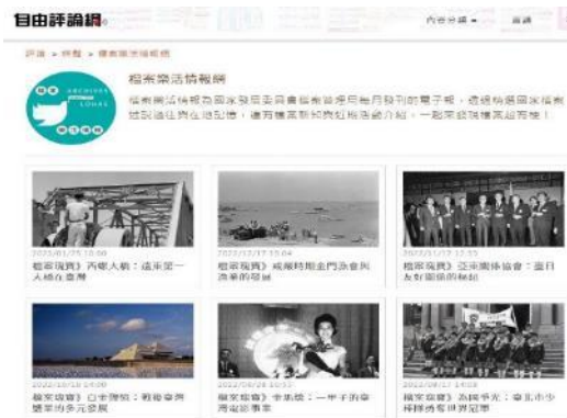
NAA column on the Liberty Times