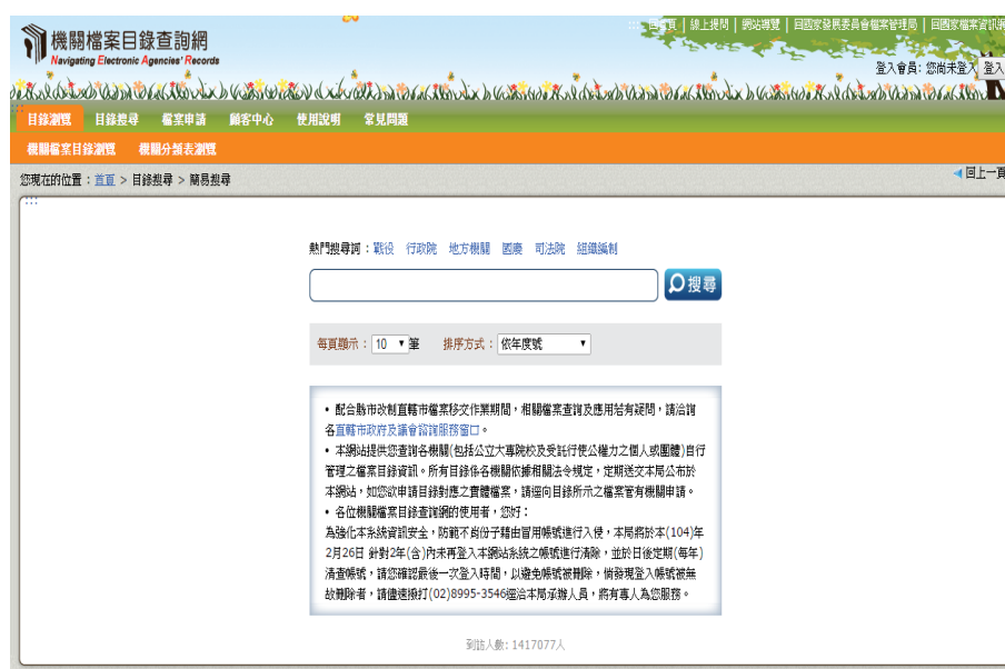
Navigating Electronic Agencies' Records (NEAR) website

As of the end of 2020, the total number of government agency records catalogs published on NAA's NEAR website ( https://near.archives.gov.tw ) stood at 471,453,636.