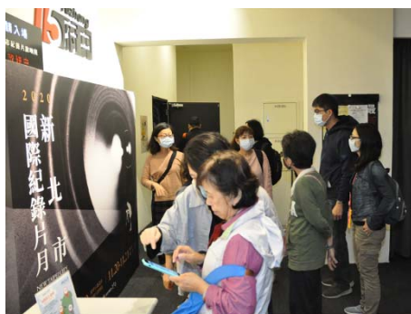
2020 Archives month activities