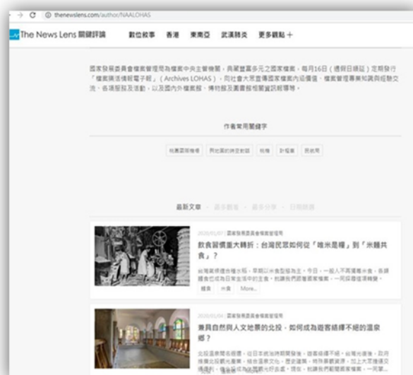
NAA column on The News Lens

In order to increase reader reviews and enhance promotion effectiveness, NAA created a column on the News Lens platform to publish articles from "Archives LOHAS" focusing on current events.