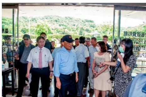
Premier Tseng-Chang Su (3rd from the left) visited the Taiwan Provincial Administration Information Hall on July 27, 2020

The Taiwan Provincial Administration Information Hall is open to the public. The front block of the Taiwan Provincial Administration Information Hall and the Lotus Garden, were declared historical buildings by the Nantou County Government on April 13, 2011. In 2020, the visitor or applicant count was 14,913.