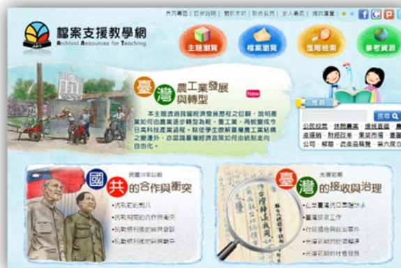
Homepage of Archival Resources for Teaching (ART)

In 2020, to enhance the use of archives for teaching and research, NAA added 70 items pertaining to "Transportation network and development in Taiwan" to the ART website ( https://art.archives.gov.tw ), and held 8 outreach programs for students and teachers, with a total of 709 participants.