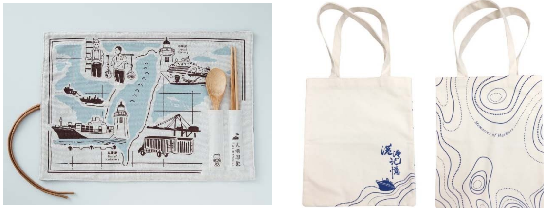
New Archives cultural goods launched in 2020

To promote the sale of archives-related cultural goods, NAA established a showcase in the Exhibition Hall, and has sold them on the official website. From 2019, NAA has expanded consignment channels such as National Chiang Kai-shek Memorial Hall, Taoyuan International Airport Terminal 1 and 2, and Government Publications Bookstore. In 2020, NAA launched some new archives-related cultural goods, including a "Memories of Harbors canvas bag" and a "Port Impression Table Mat". A total of 20 products have been launched.