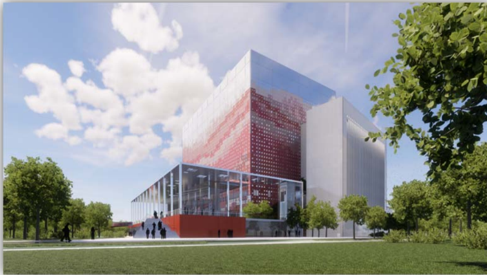
National Archives building facade simulation

completion of the National Archives building in 2025, the storage capacity will reach 100 kilometers.