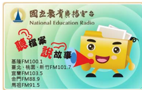
The radio program "Listening to Archives, Telling Stories" on NER

To disseminate information about its archives services, NAA has worked with National Education Radio (NER) to create a program called "Listening to Archives, Telling Stories." Its first broadcast was on January 20, 2017, and the program can be heard regularly on the fourth Friday morning of every month.