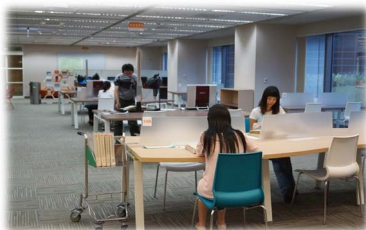
Members of the public come in to access the archives

The Archives Access Center's main services include the following: It provides a professional publication on archives management; accepts applications for access to archives; introduces archival holdings; and facilitates archives catalogs queries. In 2020, there were 1,608 visits to the center. Responses to "purpose of visit" questionnaires (multiple choices allowed) indicated that 1,216 persons came to apply for access to archives, 178 persons for information inquiries, 64 persons for access to publications, and 218 persons for other purposes.