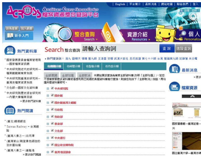
Archives Cross Boundaries (ACROSS) website

archives in Taiwan. In 2020, 7,060 visitors to ACROSS made a total of 49,299 searches.