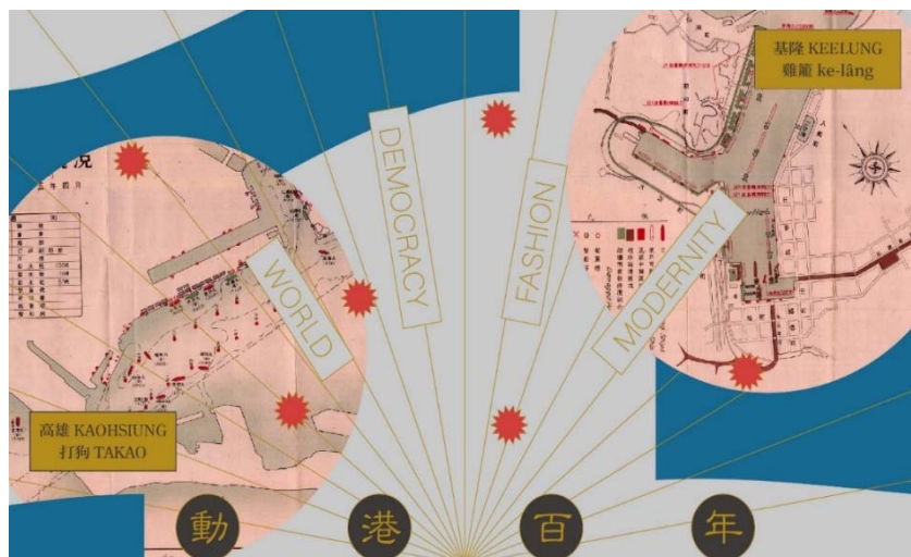
A webpage of "Moving Harbors for 100 years"