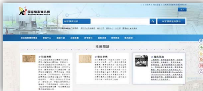
Archives Access Service website

88,227 items (including 3 applications for access to 27 items deposited with other agencies).