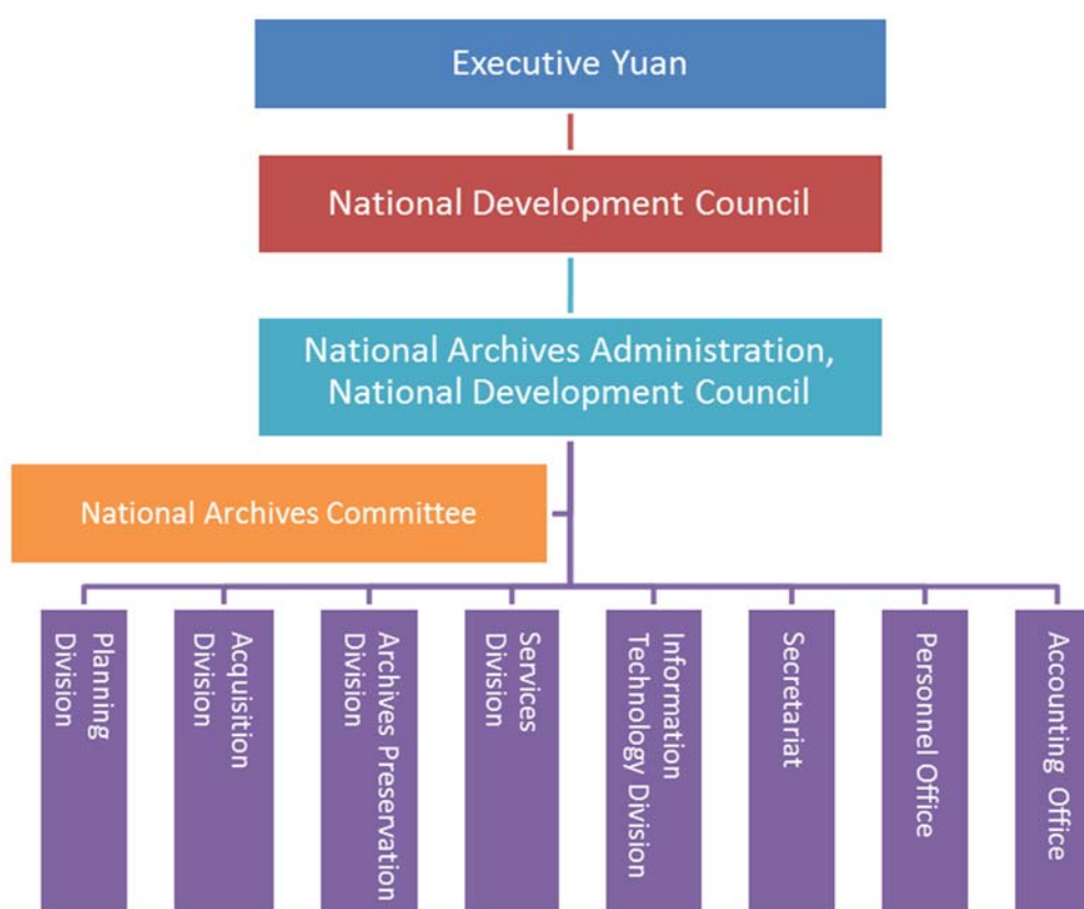
Chart 1 Organizational structure

The NAA, operating under the NDC, consists of five divisions and three offices: Planning Division, Acquisition Division, Archives Preservation Division, Services Division, Information Technology Division, Secretariat, Personnel Office, and Accounting Office. The organization also includes the National Archives Committee, which is responsible for reviewing appraisals, classifications, retention periods, and disputes. The Committee also provides consultation services in regard to archives management and access policy.