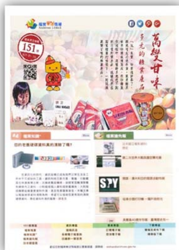
Homepage of "Archives LOHAS" No. 151

universities and colleges; scholars, specialists, and organizations conducting historical research; records managers from government agencies, and so on. In 2020, a total of 12 issues of "Archives LOHAS", from Issue No.151 to No.162, were published, and the number of subscribers reached more than 17,580.