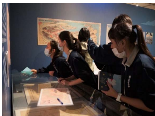
"Play the two ports" game and guided tour