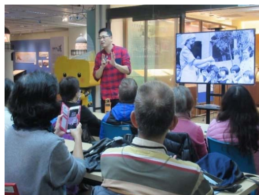
"Meet a Curator" weekend workshop