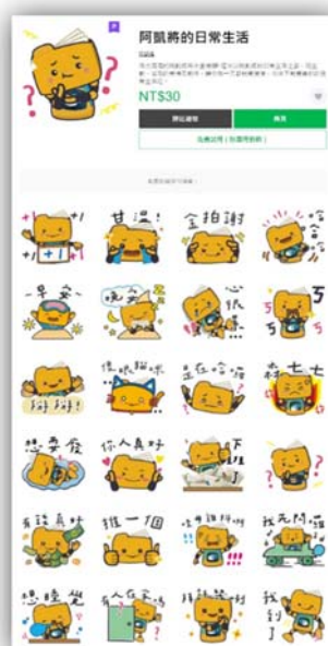
Archives Line stickers

NAA commissioned an artist to create 24 Line stickers using the picture of the archives mascot for promotions. In 2020, a new series of daily life Line stickers featuring the Archives mascot was launched. It uses common words, expressions and actions to convey greetings, encouragement and friendship. This sticker is a promotion for NAA related activities and is available for the public to purchase.